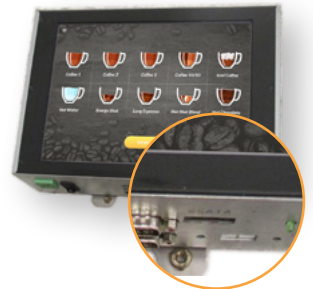
Black and stainless